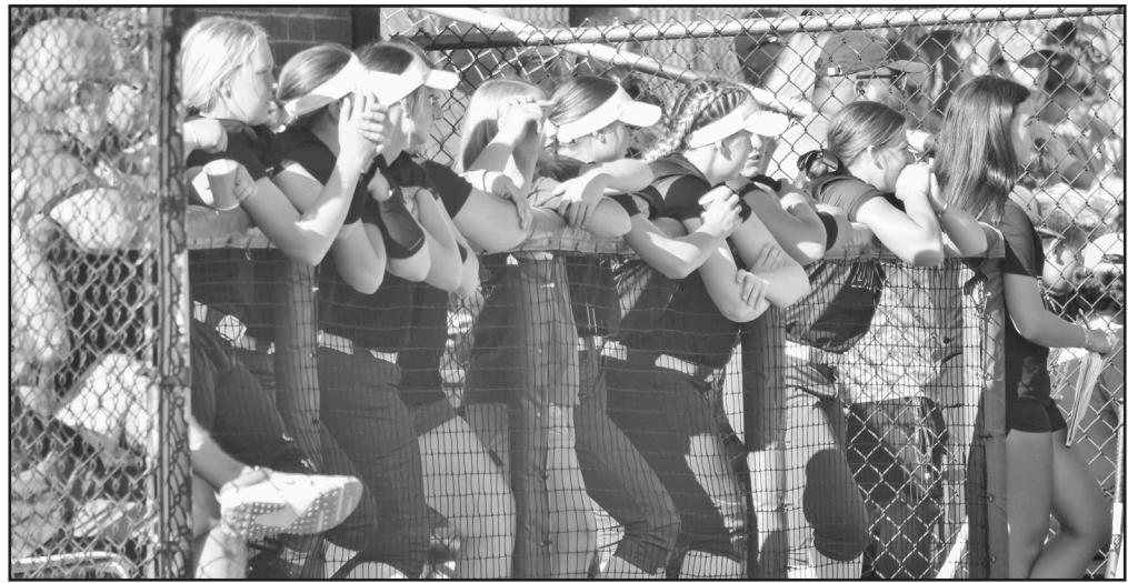
The Union County dugout cheers on their teammates vs. North Murray.